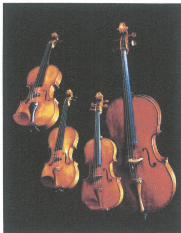
Stradivarius "Paganini Quartet"