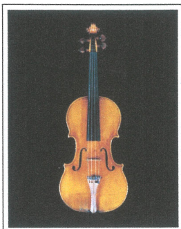
Stradivarius 1714 Violin "Dolphin"